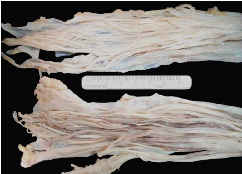
Figure 1. Normal cauda equina (top) and postmortem sample showing thickened nerve roots and cauda equina with patchy vascular prominence.