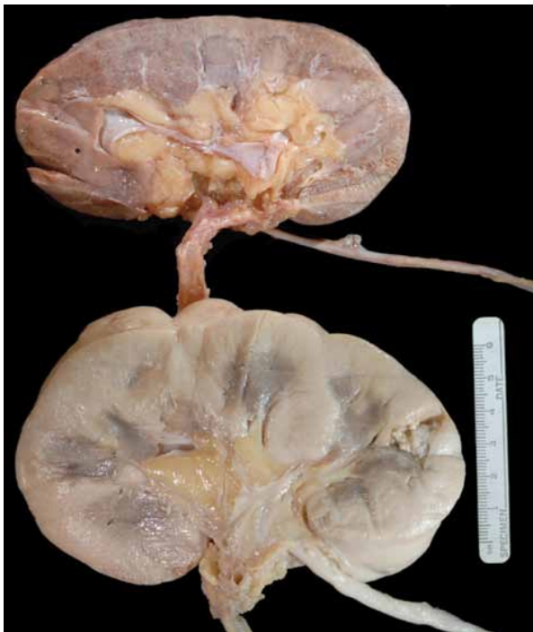
Figure 2. Normal kidney (top) and postmortem specimen with diffuse pallor and enlargement. The kidney weighed 388 g and measured 13.6 \times 8.1 \times 6.2 cm.

by a CD20-positive large B-cell lymphoma representing less than 10% of marrow cellularity.